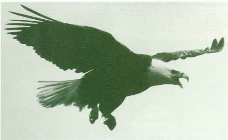
Bald eagles hunt in the waters of Fossil Creek Reservoir.

During 1997, the majority of our work took the form of strategic planning, land negotiations and initiation of low-cost programs. These efforts set in place important guides for the future. Following are brief descriptions of some of our most important highlights.