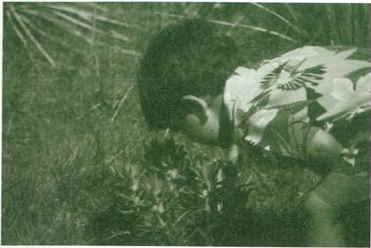
Open space for people as well as wildlife.

In 1996, the first full year of the Open Lands Program, we identified a few key parcels of land that were essential to include in our preservation program. Efforts to purchase those properties were successful and the early goals of the program have been met.